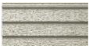
Triple 3" clapboard