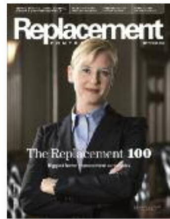
Window World Tops 2012 National Remodeling Rankings.