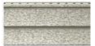
Double 4" clapboard