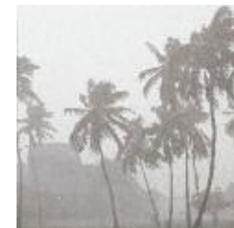
In independent tests, Window World 4000 Reinforced Vinyl Siding withstood category 5 hurricane-force winds.

Window World 4000 Reinforced Vinyl Siding is backed by a lifetime, limited transferable warranty*—including fade and hail protection. Protecting not only you, but the next owner of your home as well.