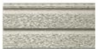
Double 4" dutch lap