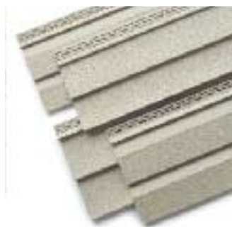
Choose from 4" or 5" dutch lap and clapboard profiles.