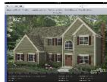
Our Window World Design Showcase will help you choose the most attractive products for your home. Available online or as a tablet app.

We know that replacing your siding can increase the value of your home, but what happens when you sell your home? According to Remodeling Magazine's 2011-2012 Cost vs. Value Report, vinyl siding, on average, recoups an average of 72% of the initial investment. Tough to argue with those figures.