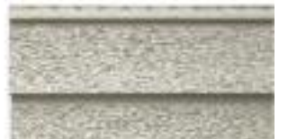
Double 5" clapboard