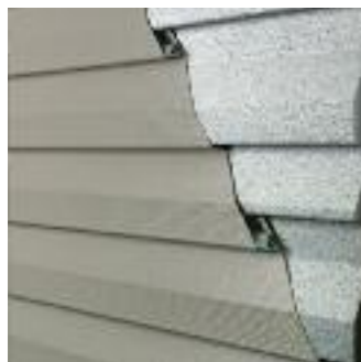
Window World 4000 Energy Plus Siding improves energy efficiency and has a beautiful finished appearance.