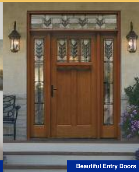
Beautiful Entry Doors

Window World Premium Replacement Windows are designed for superior performance and exceptional beauty. Choose from Double-Hung, Sliding, Casement, Awning, Bay, Bow, and Garden Windows and beautiful Patio Doors. All windows feature a multi-chambered sash and mainframe structure which helps to create insulating air space for superior thermal efficiency. Additionally, the optional SolarZone™ Insulated Glass package offers optimal performance in any climate.