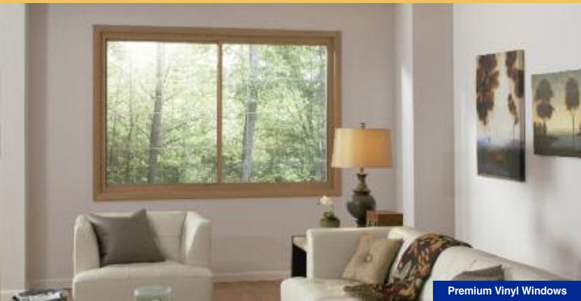
Premium Vinyl Windows