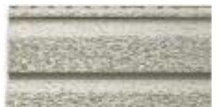
Double 5" dutch lap