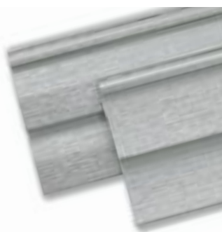
Classic 4 1/2" clapboard and dutch lap profiles.