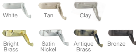
White Tan Clay Bright Brass Satin Nickel Antique Brass Bronze