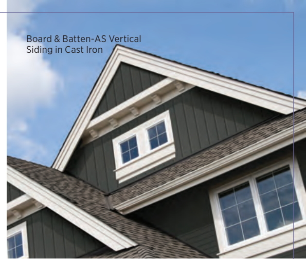
Board & Batten-AS Vertical Siding in Cast Iron