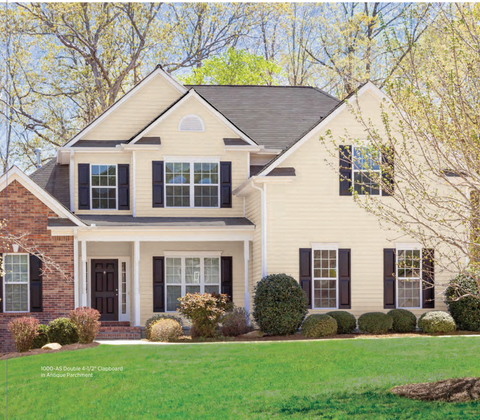
1000-AS Double 4-1/2" Clapboard in Antique Parchment

The perfect balance of quality and value, Window World 1000-AS Vinyl Siding gives you the outstanding beauty of natural cedar grain texture with none of the maintenance worries of painted wood. This highly weatherable panel creates an easy-care home exterior, which can heighten the curb appeal of your home as well.