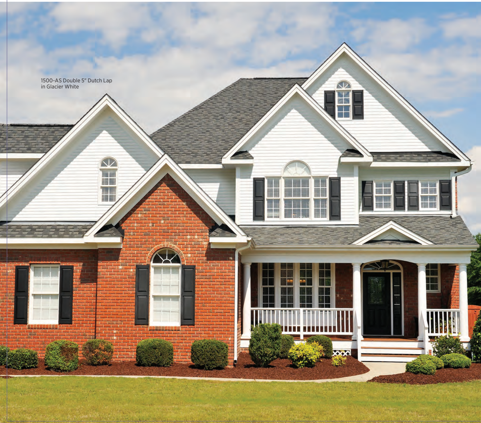
1500-AS Double 5" Dutch Lap in Glacier White

Durable and dependable, Window World 1500-AS panel construction is enhanced with a reinforced, rolled-top nailing hem for increased strength and structural integrity. This sturdy wall attachment ensures the siding stays firmly in place, achieving overall stability and excellent performance despite exposure to harsh winds and weather.