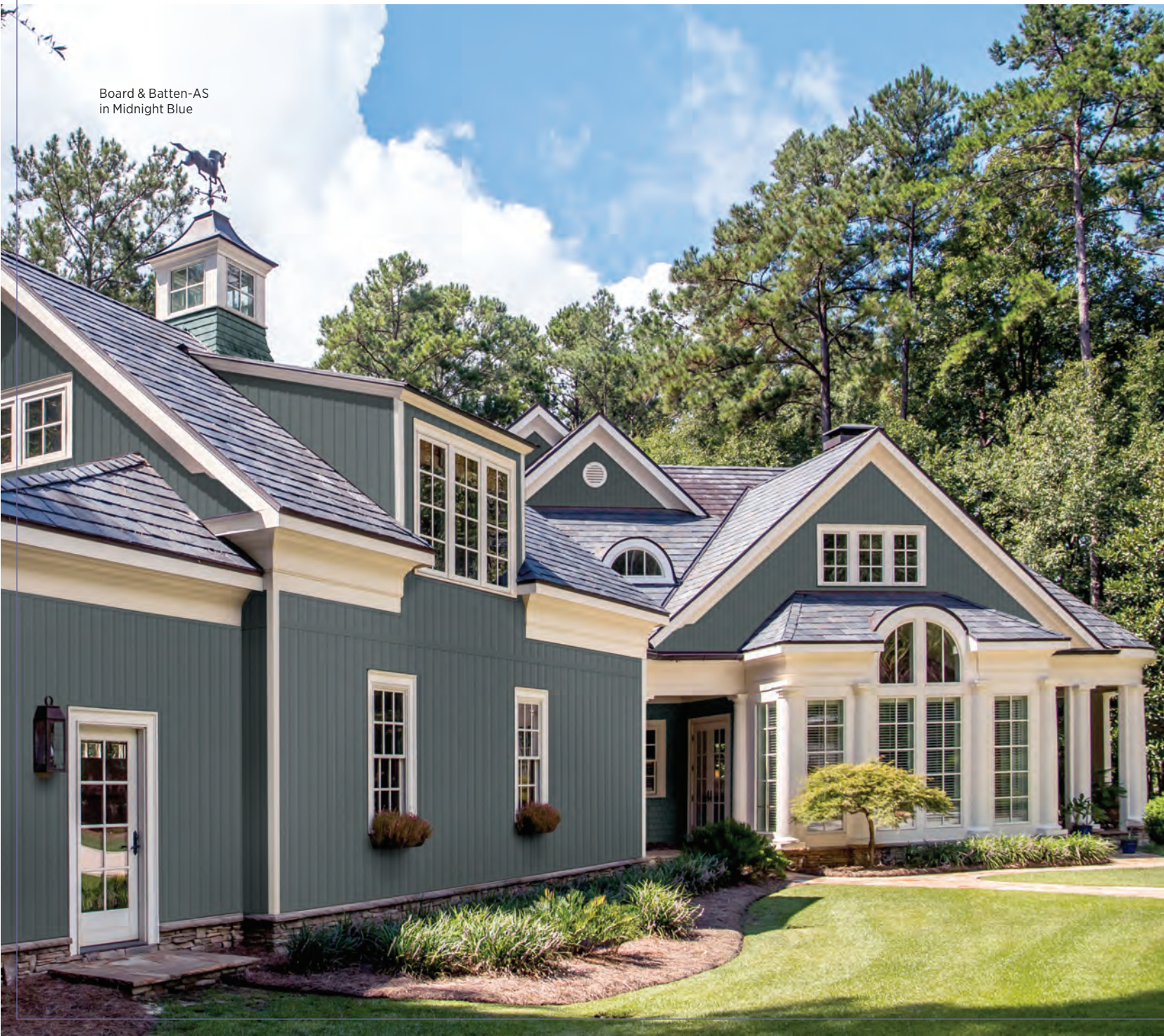
Board & Batten-AS in Midnight Blue

In Board & Batten-AS, you have discovered a beautiful home exterior that creates the distinctive look of handcrafted wood siding, but without the time-consuming maintenance. The heavy-duty design and construction of this high-performance vertical profile will give your home an exceptional exterior.