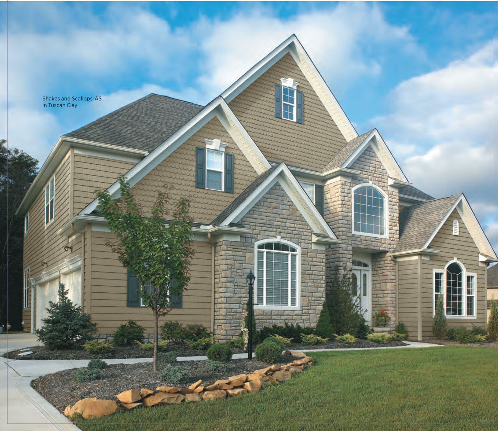
Shakes and Scallops-AS in Tuscan Clay

Once only associated with Coastal, Victorian, or Queen Anne homes, shakes and scallops are becoming increasingly popular siding options for homes across the country. Pairing perfectly with siding and other cladding materials for added depth and custom appeal, Window World Shakes and Scallops-AS are designed to offer you the natural beauty of cedar that's easy to clean and affordable to maintain.