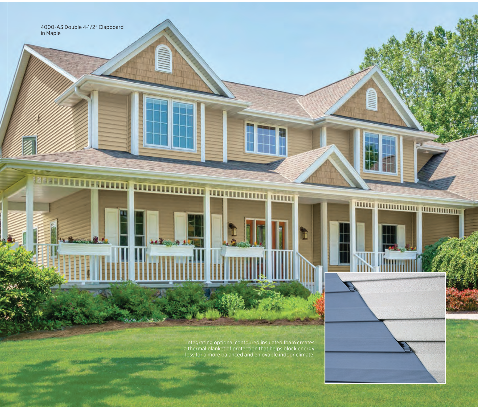
4000-AS Double 4-1/2" Clapboard in Maple

Integrating optional contoured insulated foam creates a thermal blanket of protection that helps block energy loss for a more balanced and enjoyable indoor climate.