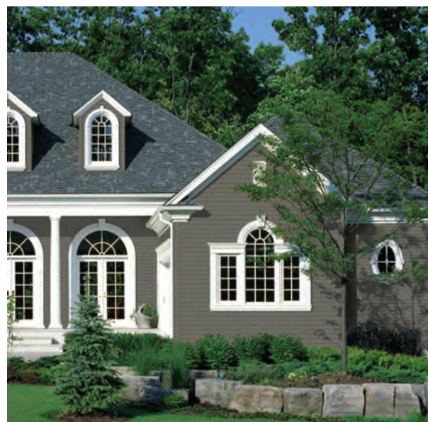
2000-AS Double 4" Clapboard in Ageless Slate

All colors may not be available in all profiles.