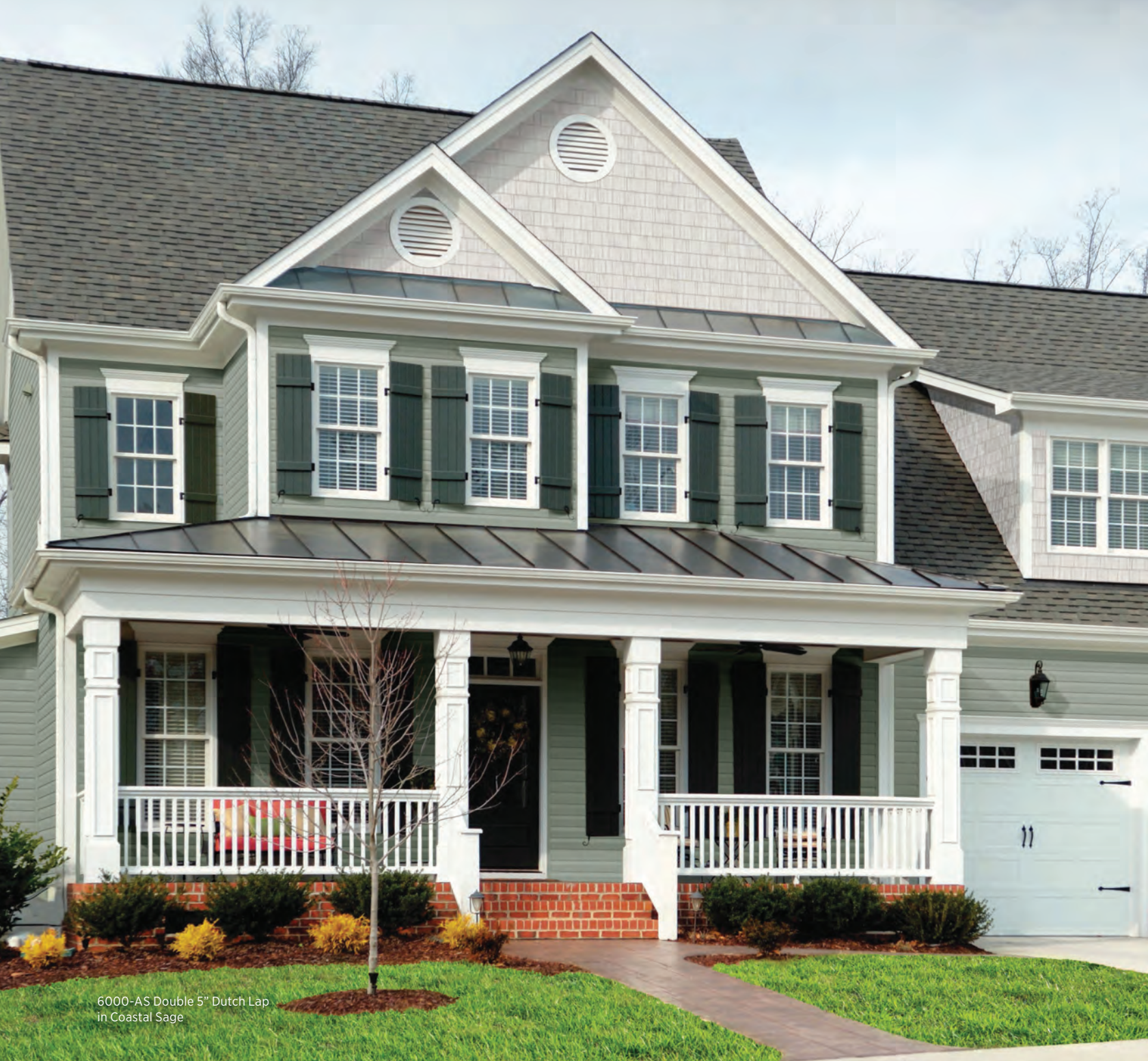
6000-AS Double 5" Dutch Lap in Coastal Sage

Premium Vinyl Siding and Soffit Collection