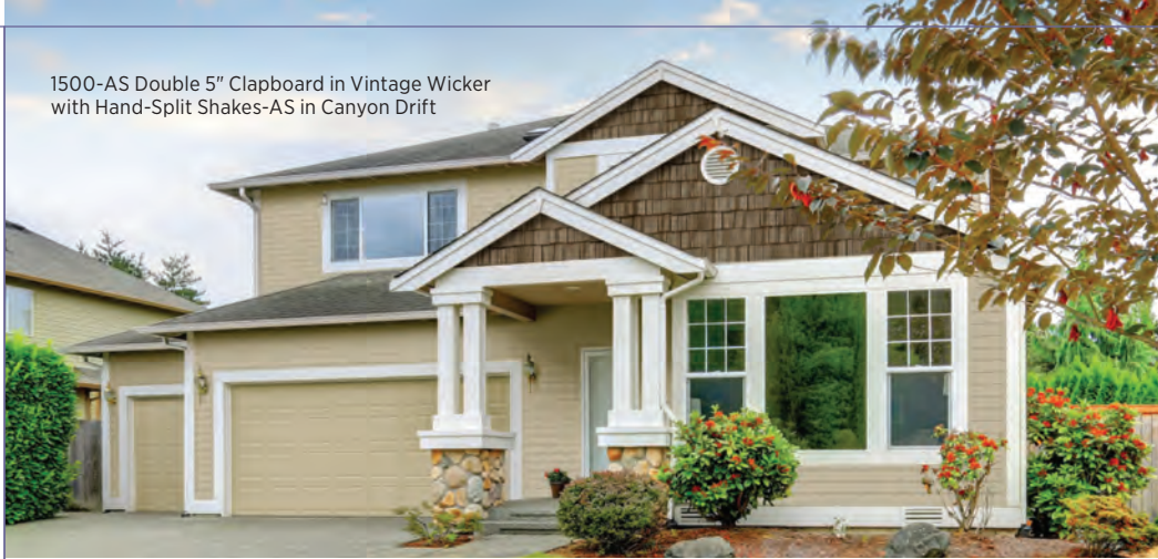
1500-AS Double 5" Clapboard in Vintage Wicker with Hand-Split Shakes-AS in Canyon Drift